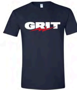
Grit Softstyle Unisex T-Shirt From $21.99