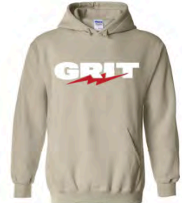
Grit Heavy Blend Hoodie From $39.99