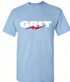
Grit Short-Sleeve T-Shirt From $18.99