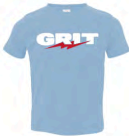
Grit Toddler T-Shirt $18.99

Need more GRIT SWAG? GRIT has partnered with Pack for Camp to provide a range of GRIT logoed shirts, hoodies, water bottles and more! You can buy directly from their website here or go to the GRIT website. Wear them with Pride!